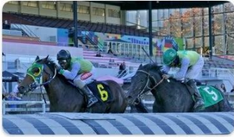
MISS THE HYPE