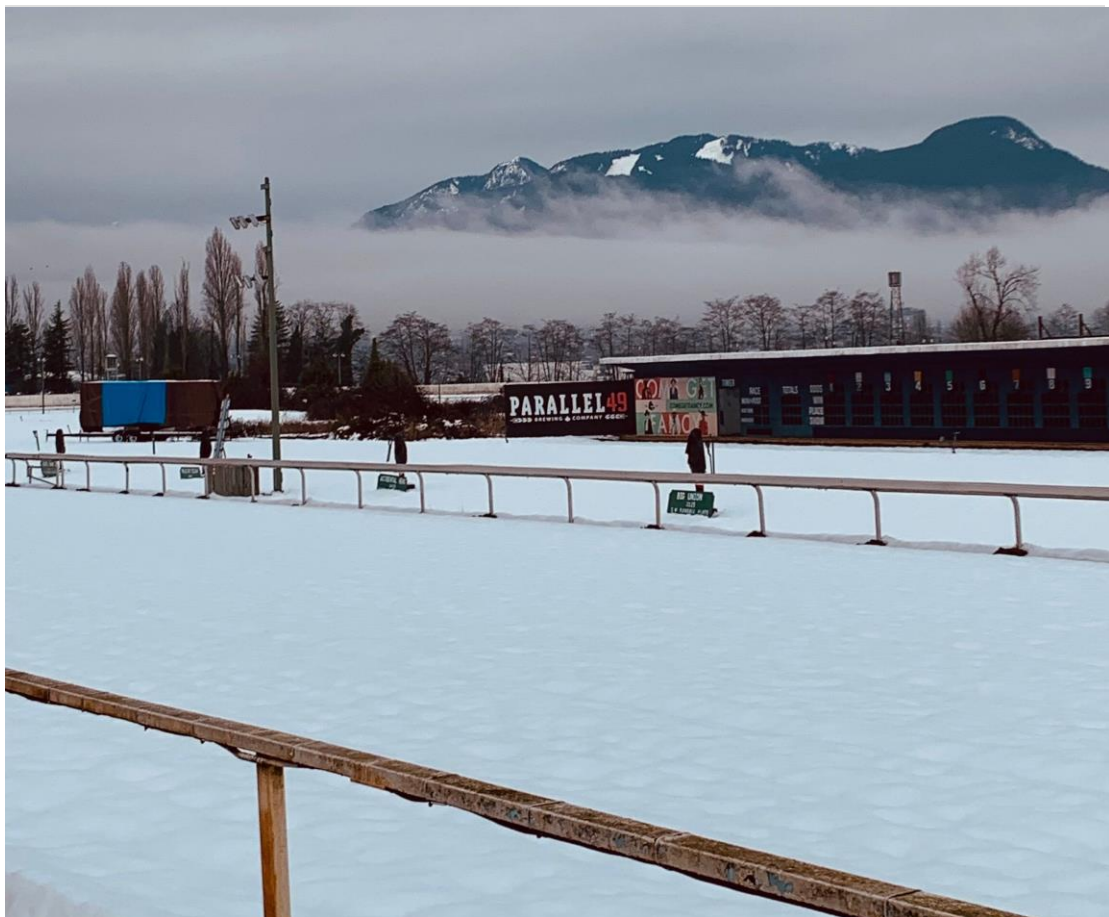
Hastings under snow this week