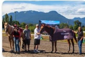
WE B THREE